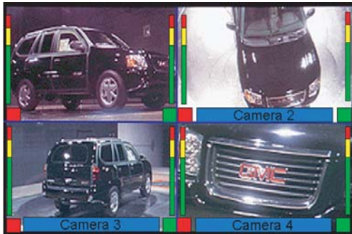
RAINIER 4d - 4 auto-detect SD-SDI / composite video (PAL / NTSC) inputs