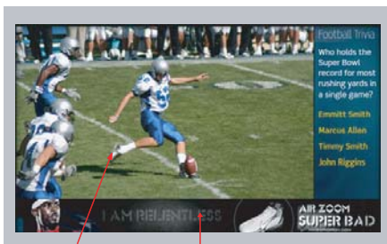
Set-Top Box 1080P Input Computer 1080P Background Input