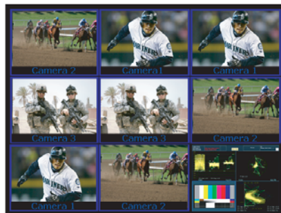
RAINIER 8d1v - 8 auto-detect SD-SDI / composite video (PAL / NTSC) inputs PLUS 1 auto-detect VGA / DVI (YPbPr) input